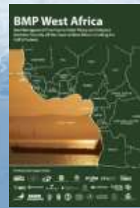
BMP West Africa