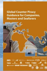
Global Counter Piracy Guidance