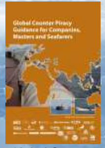
Global Counter Piracy Guidance