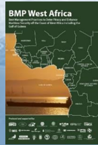
BMP West Africa