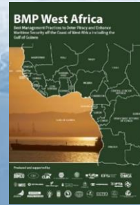
BMP West Africa