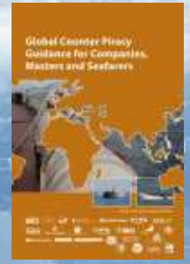
Global Counter Piracy Guidance