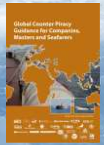
Global Counter Piracy Guidance