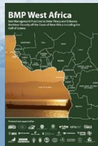
BMP West Africa