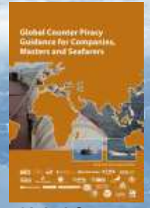
Global Counter Piracy Guidance