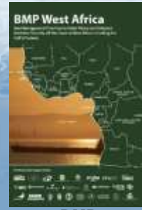
BMP West Africa