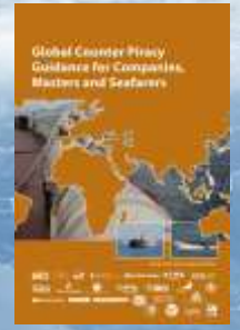
Global Counter Piracy Guidance