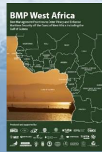
BMP West Africa