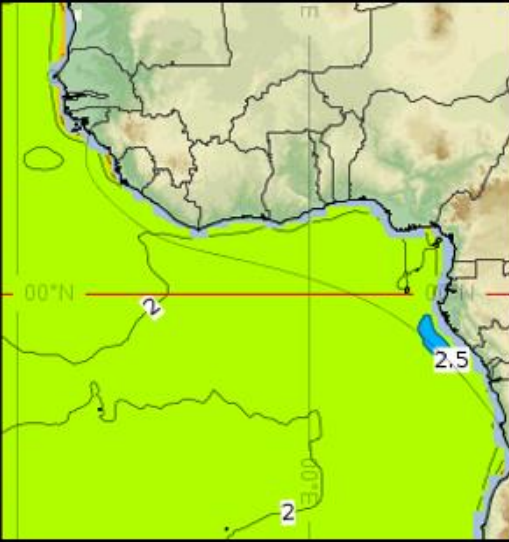
Saturday 27 July at 12Z