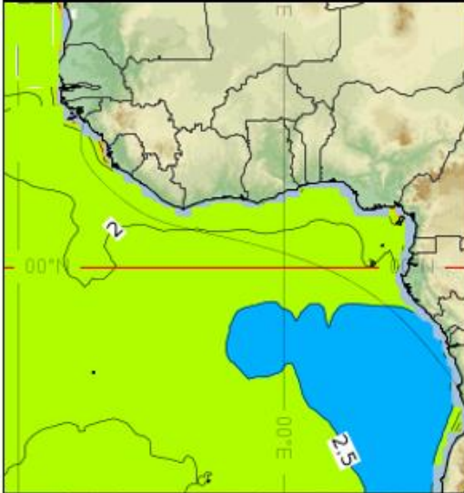
Friday 26 July at 12Z