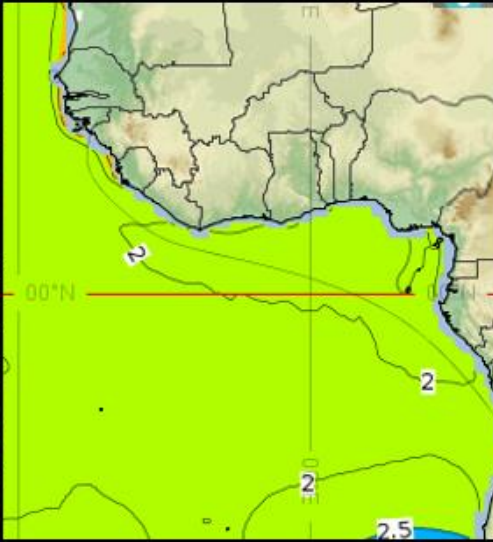
Sunday 28 July at 12Z