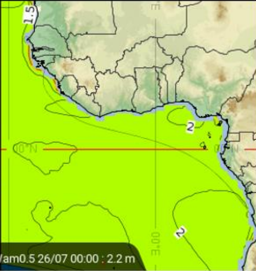
Tuesday 30 July at 12Z